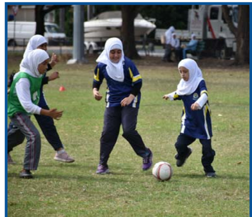
WALK SAFELY TO SCHOOL DAY

Students are enthusiastic participants and look forward to their sports day.